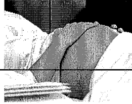
10-year-old gives birth to baby boy