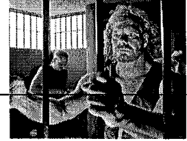
A&E cancels 'Dog the Bounty Hunter'